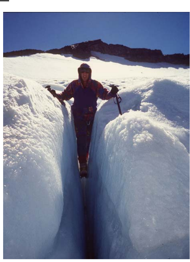
The Newsletter Editor hiding in the Mangaehuehu Glacier, March 2000