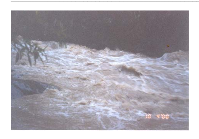
The Waikotore River, Northern Ruahines in flood, April 2000. A reminder of what it was like in the Tararuas.